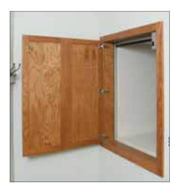
Dumbwaiters and Cargo Lifts