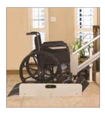
Incline Platform Lifts