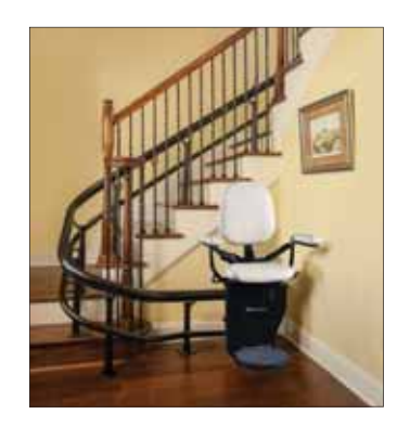
Curved and Straight Stair Lifts