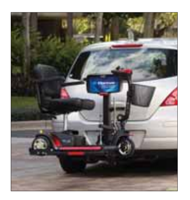
Multiple auto lift solutions for chair or scooter